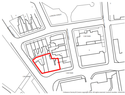
01 | SITE LOCATION PLAN Scale 1:1250 @ A3